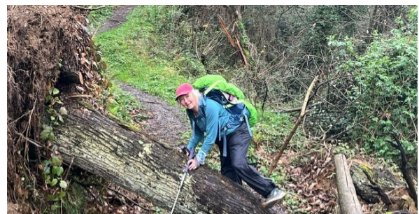
There's a tree on the trail!