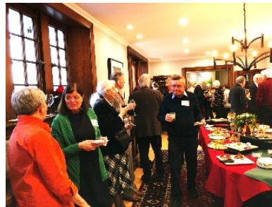
Conversations around the hors d'oeuvres table