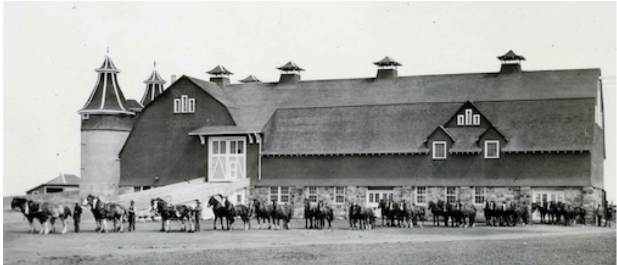
A photo from the 1920's of the Stone Barn