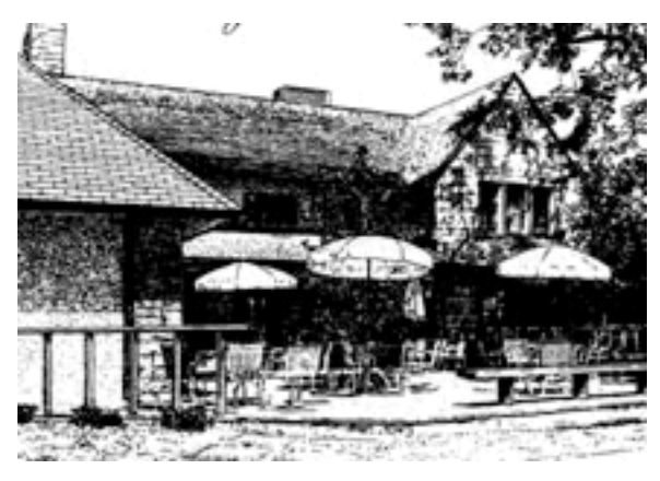
Faculty Club $15.00 per Guest