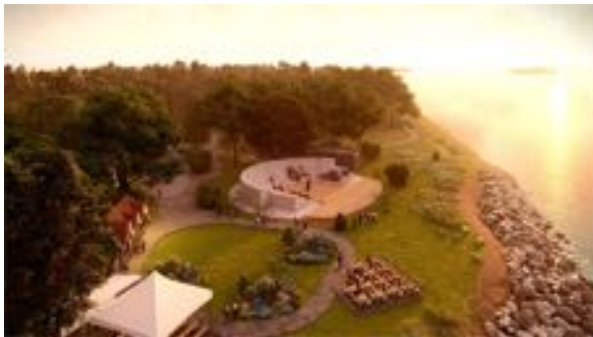
Architect's Rendering of Proposed Site

Shakespeare on the Saskatchewan (SOTS) is planning with the City of Saskatoon and Meewasin Valley Authority to develop its leased space, next to the Children's Museum, into a new park with public trails beside the river, accessible year round. Permanent structures, including locked storage and an amphitheatre with river view as base for SOTS' main stage tent, will save the troupe set-up time for their annual Festival and allow rental of the space to other event organizers (e.g. the Children's Festival) before and after their July-August season. Come see and comment on the plans at the Staging the Future Campaign ( http://www.shakespearesask.com/pages/staging_the_future.html ) site.