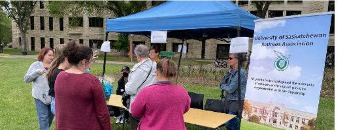
Celebration Banquet at WDM, June 23